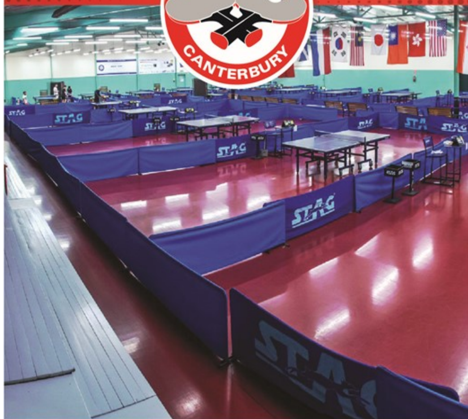
Table Tennis Canterbury

294 Blenheim Road, Upper Riccarton, Christchurch 8041