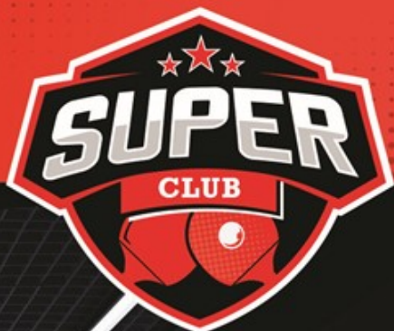
TABLE TENNIS CANTERBURY PRESENTS...